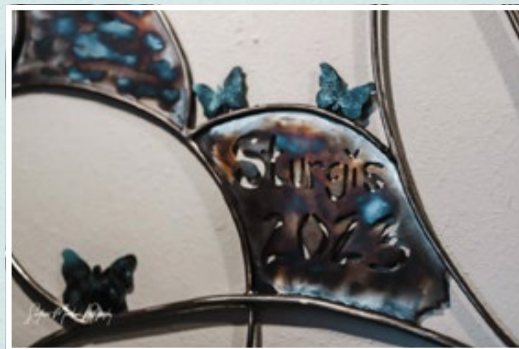
Forged in Silence: Wings of Change