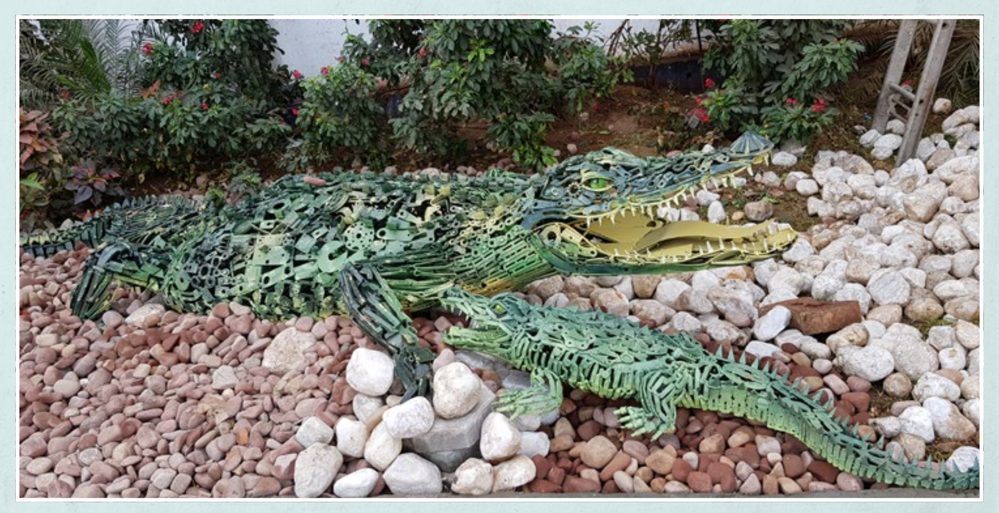
Croc Mother and Child